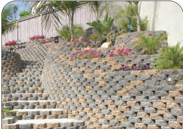
Retaining or Terrace Walls