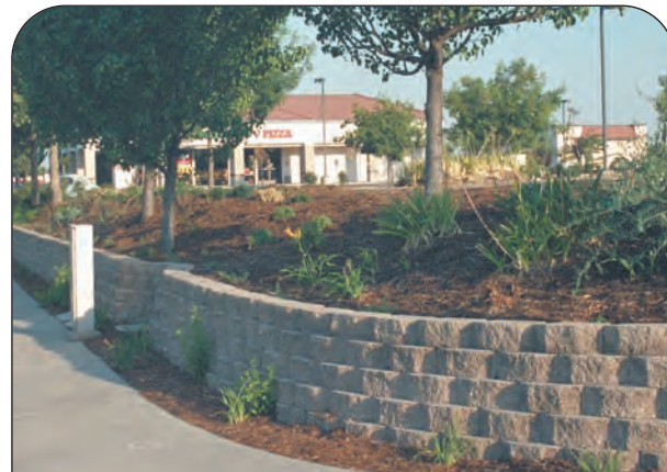
Small Commercial Walls