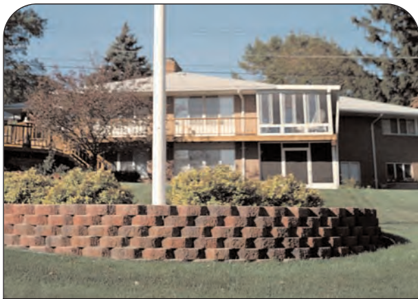
Garden Borders or Planters