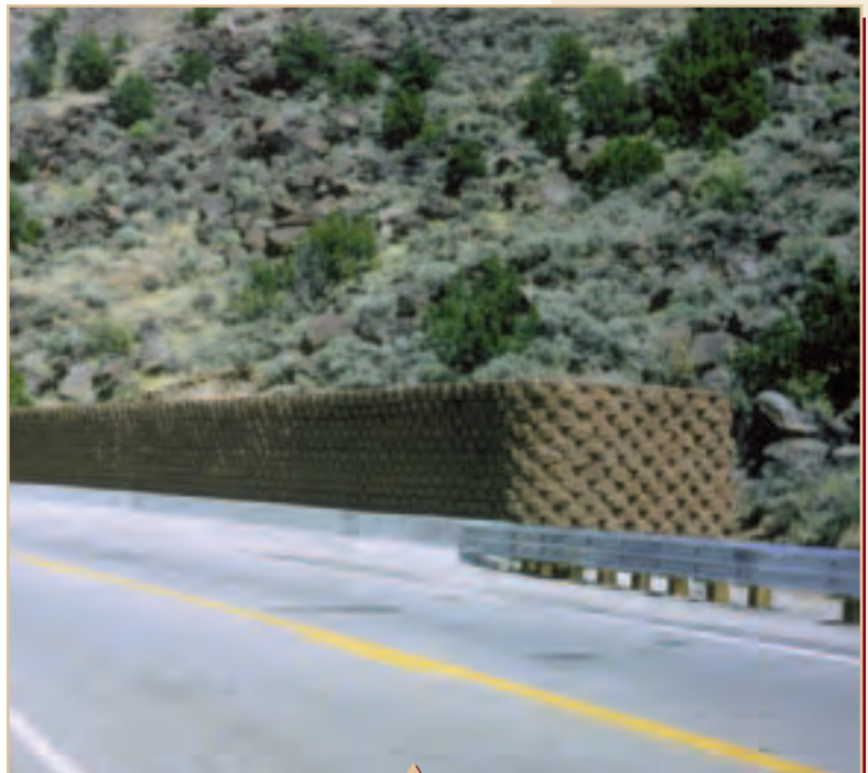
Keystone barrier wall, Rio Arriba County, New Mexico