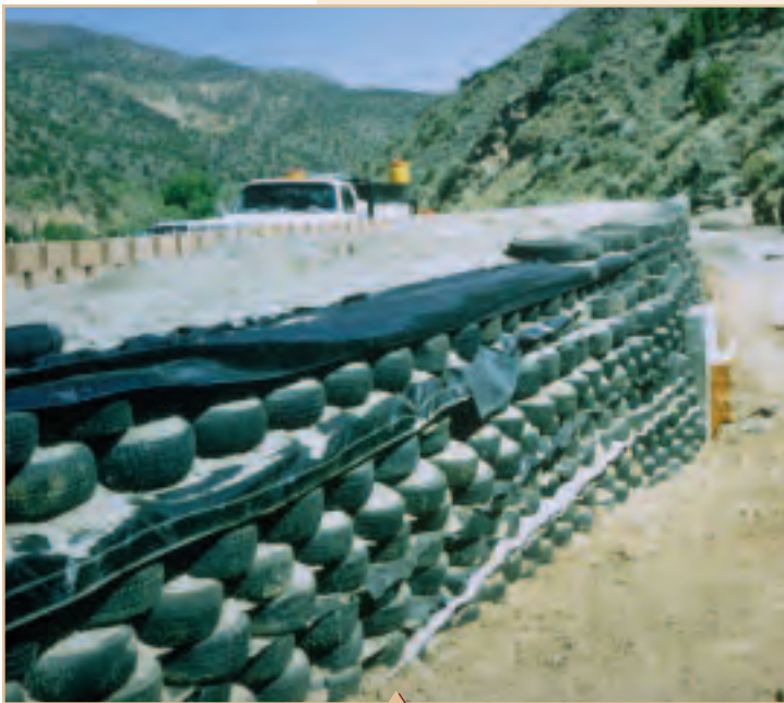
Tire wall at back of the barrier, cushions falling rocks and directs them into the catchment area.

The result was a functional, attractive, cost effective barrier that tamed the mountain side. The creative efforts of the design engineers, using the proven Keystone Retaining Wall System, controlled the danger, ensuring the safety of all motorists who pass by.