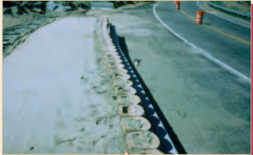
Falling rock barrier - Keystone wall facing the road, with reinforced soil zone behind, backed by wall of old tires.

Wall with a Keystone Retaining Wall System. Keystone offered structural integrity, ease of installation, aesthetic appeal and cost effectiveness. Albuquerque Underground constructed the reinforced wall with 2,160 Keystone Compac Units in Desert Beige color. The wall stands 12 feet high (3.7m) and 180 feet (54.8 meters) long. Reinforcement for the soil mass behind the Keystone wall consists of Mirafi's Miragrid 5T, 500X, 700X and 800X, soil reinforcing geogrid.