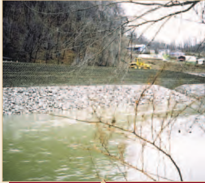
View of Flood Wall with Rip Rap at Toe to Prevent Base Scour

After installation of the Keystone Retaining Wall, an additional flood wall with gates was constructed at the top of the wall as a final design element to protect the town, four CSX railway tracks and the state highway from flood damage. Under the critical conditions of a future 100-year flood event, this wall will serve as a shield for the highway and the railroad by protecting against river flow rates of 122,000 cfs with velocities of 10 fps. This represents about 95% of known flood conditions. The wall design and engineering takes into account that during extreme flood conditions, the entire retaining wall will be submerged 17 feet (5.2 m) below the floods crest and yet maintain the integrity of the entire structure.