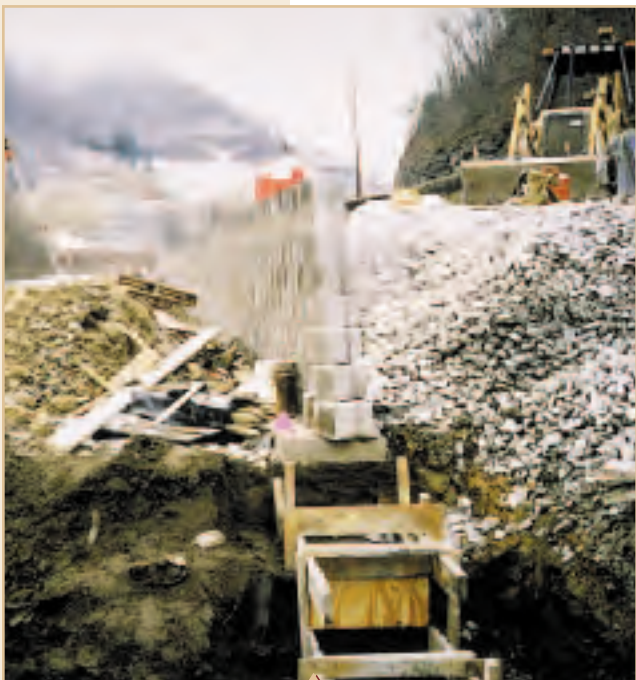
Partial Wall Shown with Forming for Additional Concrete Leveling Pad

Because the base elevation of the wall started at the river's edge, construction began when the river was at its lowest point, with installation progressing at a rate to stay ahead of the spring rains. The installation method proceeded rapidly through the winter due to the granular backfill and the use of steel grid - neither of which is affected by cold weather.