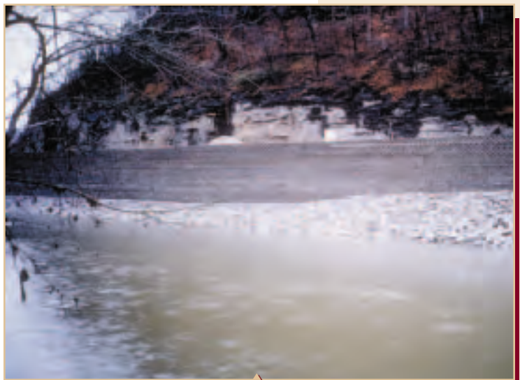
View from opposite shore of the Keystone Flood wall on the Cumberland River