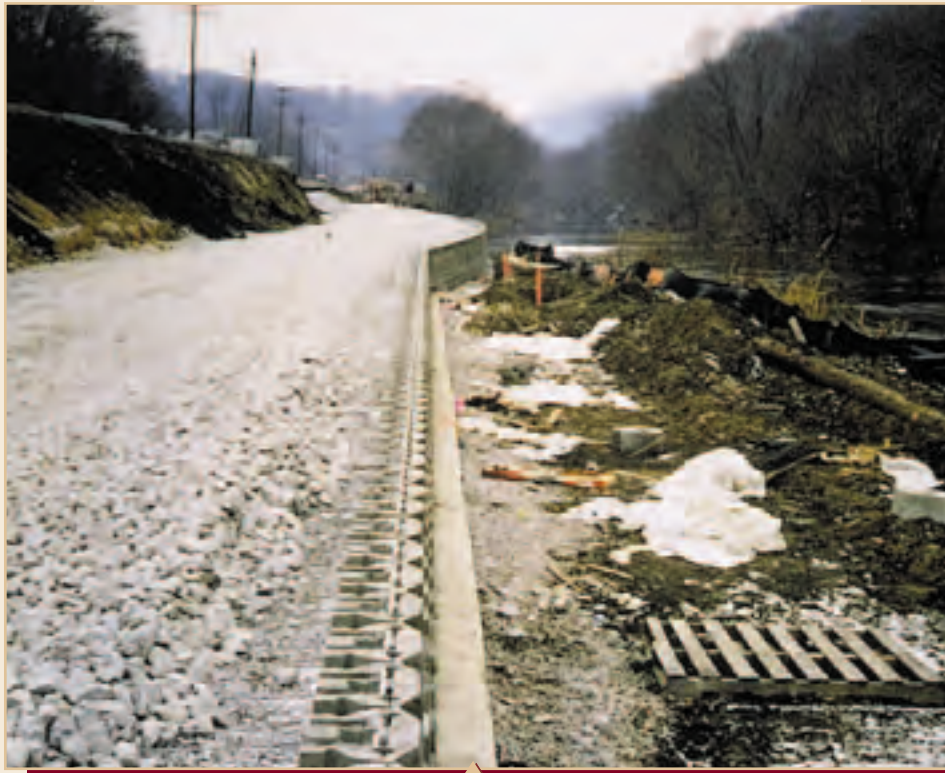
Wall Under Construction - Concrete Leveling Pad, Curved Geometry and Select Drainable Backfill

Because the base elevation of the wall started at the river's edge, construction began when the river was at its lowest point, with installation progressing at a rate to stay ahead of the spring rains. The installation method proceeded rapidly through the winter due to the granular backfill and the use of steel grid - neither of which is affected by cold weather.