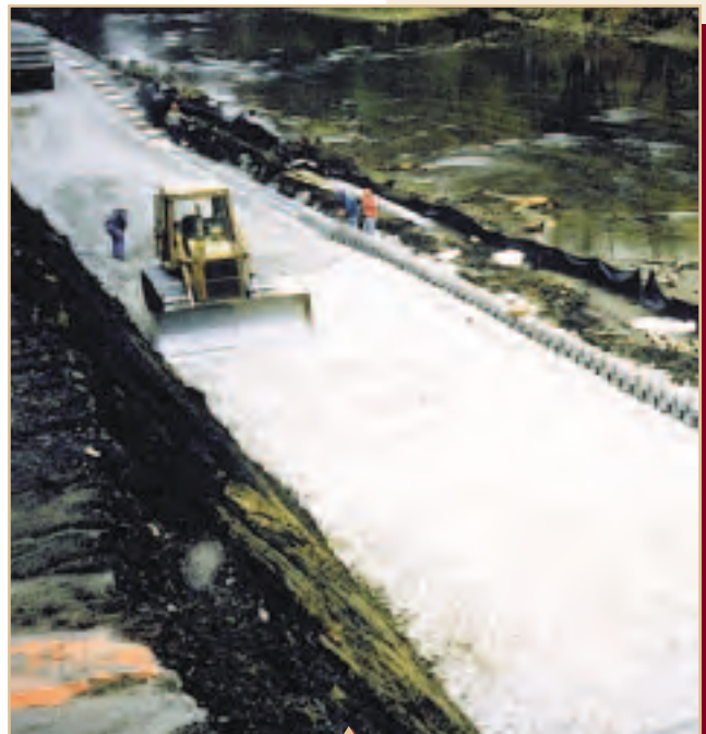
Reinforced Fill Zone Using "Select" Drainable Fill