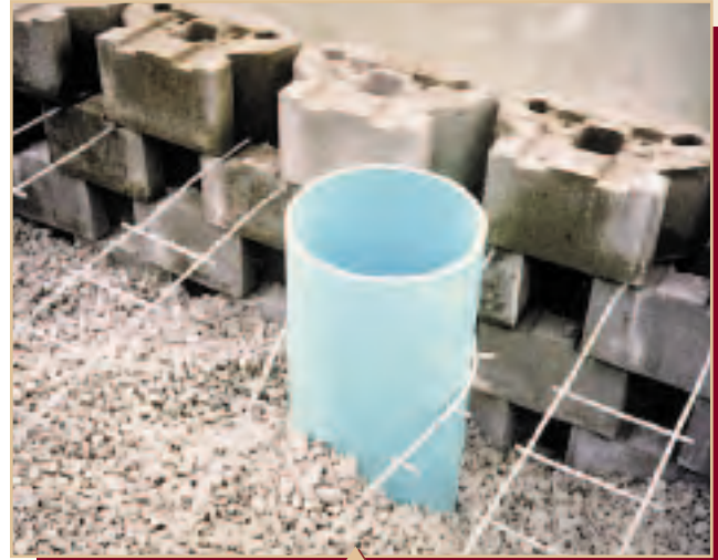
Detail at Intersection of Vertical Post Form and Keystrip Steel Reinforcement