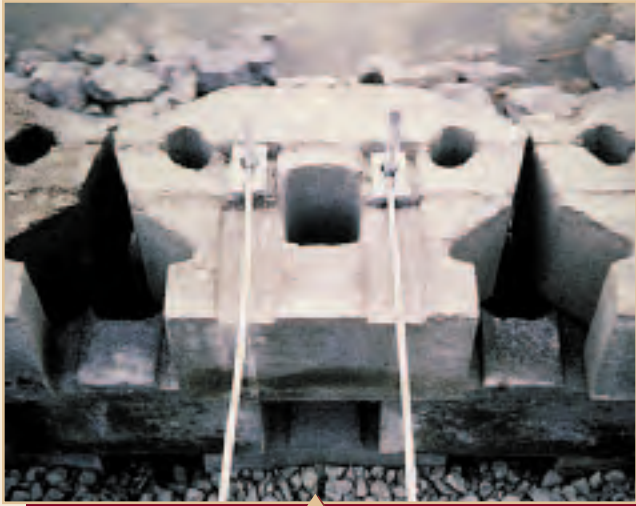
Detail of Keystone Unit & Keystrip Reinforcement

to be developed for inclusion in each bidder's package. Keystone's Engineering Department designed and specified the KeySystem I (concrete wall units with steel reinforcement) to fulfill the project requirements and meet the critical project deadline.