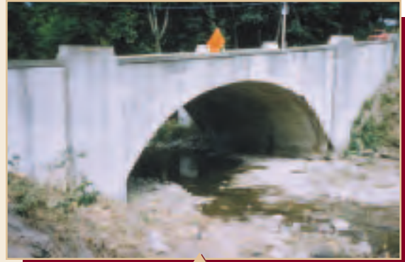
Original bridge structure

placed in a running bond pattern and connected with high strength fiberglass pins between each layer. Select, free draining backfill was placed behind the Keystone units and compacted as the units were installed one course at a time. Structural geogrids, used to reinforce the soil behind the wall, were connected over the pins and pulled taut prior to placement and compaction of backfill. This Keystone/geogrid System provides the resistance to lateral pressure from the earth fill and traffic surcharge load. The attractive concrete bridge rail system was adopted not only to provide an aesthetic solution, but also a functional crash barrier for public safety!