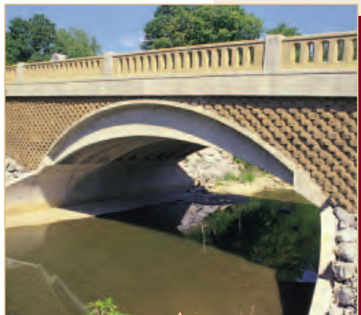
Award winning results: Function & Aesthetics