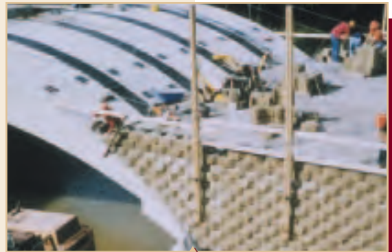
Precast arch and Keystone walls