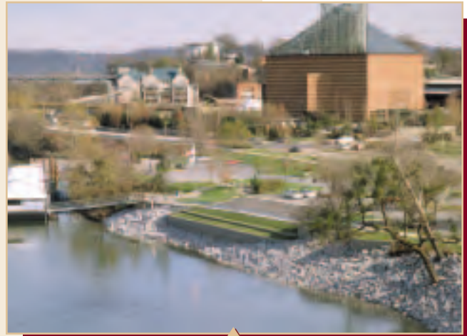
Retaining Wall Solution Protects Park Area

along with a submerged hydraulic drawdown analysis due to the frequent flooding. Analysis for the 1 year flood event called for waters to submerge the lower terrace by 3'-4" (1 m) and the 20 year event anticipates a total submersion of the entire structure at 18' (5.5 m).