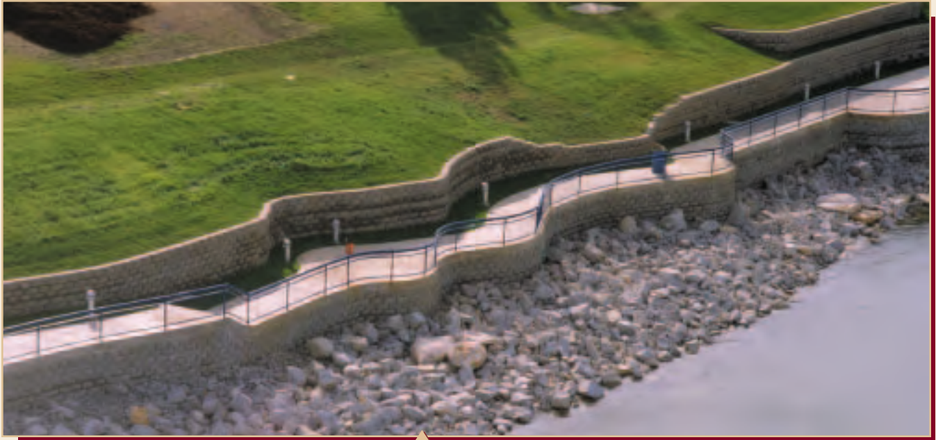
Flood Protection and Pedestrian Riverwalk come together at Historic Riverfront