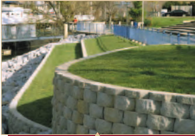
New Terrace wall protects amphitheater from erosion

Construction of the project began in the summer of 1998. The retaining walls were built by an experienced Keystone Systems installer, ABS Services of Jackson, Mississippi . After the lower terrace walls were completed, the system was put to the test with river flooding inundating the lower walls. Construction halted until the waters subsided, where examination found no erosion or damage to the structure. ABS was then able to continue the completion of the project. To provide scour resistance to the wall base, heavy stone rip-rap over geotextile was used below the lower terraced walls.