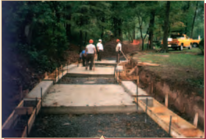
The Keystone units were placed on a concrete footing.

phase added another 450 linear feet (137m). In addition, Sager said, "Prince William County is installing the units on another portion of the same channel just outside the city." The drainage ditch in Manassas where the KEYSTONE was used is about 8 feet (2.4m) wide, with sides about 3-1/2 feet (1m) high. City workers poured the channel bottom with concrete and then built the sides with KEYSTONE Retaining Wall units. According to Sager, using the KEYSTONE system has enabled them to greatly increase the productivity of the city's ditch construction crew. "We've completed about three times the