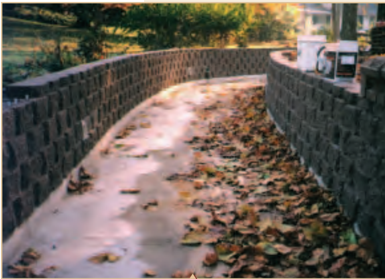
Keystone was chosen for a drainage ditch improvement project by the City of Manassas, Virginia.