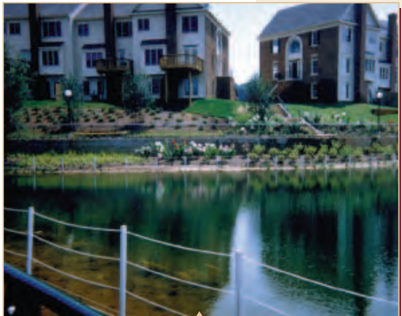
Finished retention pond surrounded by Keystone Retaining Walls