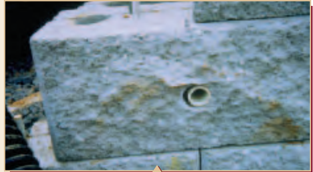
PVC pipe used as weep hole