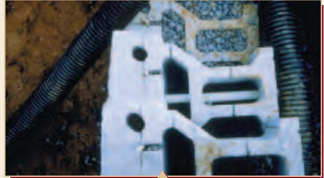
Drain tile system with PVC pipe weep holes through block

The result was a functional, attractive, low cost water management system built with Keystone retaining wall units. Keystone turned a storm pond into a pleasing water feature, adding value and curb appeal to a new housing development.