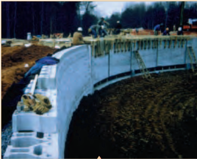
Keystone wall built next to cast-in-place concrete spillway