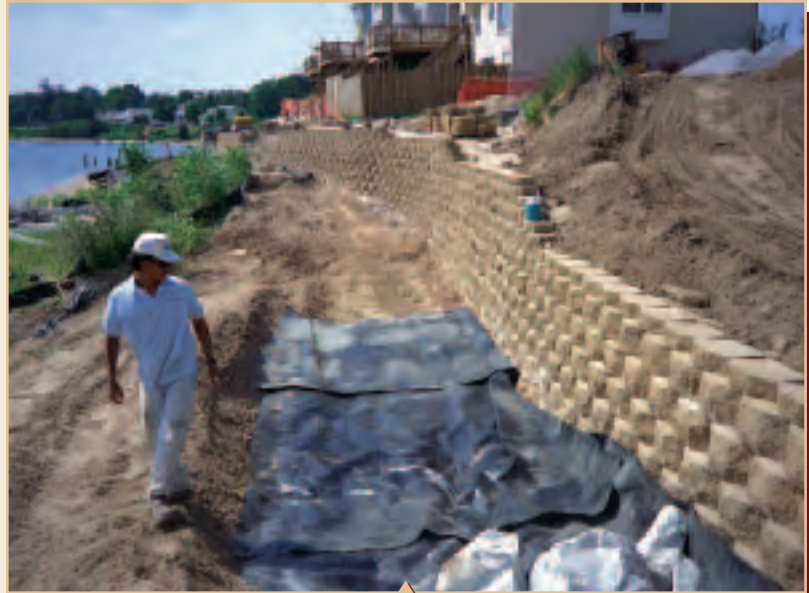
Installing the rip-rap at the base of wall.

a sediment pond at several sections of the wall. The project had to be stopped and re-engineered to account for the high moisture content of the soil in the vicinity of the sediment pond, which added additional geogrid. The 8,400 square foot wall is 900 feet (274m) long with maximum wall heights of nine feet (2.7m). Keystone Standard Units with the 3-plane rock-face texture were used on the project. They were placed on 3 feet (0.9m) of compacted 3/4" (20mm) gravel to overcome a soft base sub-soil condition. The project used approximately 3,000 square yards of Mirafi 5T & 7T with embedment lengths between 9 and 10.5 feet (0.9 - 3.2m). The wall design also called for