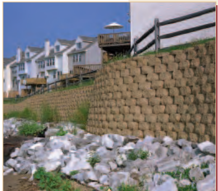
Keystone Walls offer an aesthetically pleasing solution at Stoney Beach while providing stability to the shoreline.